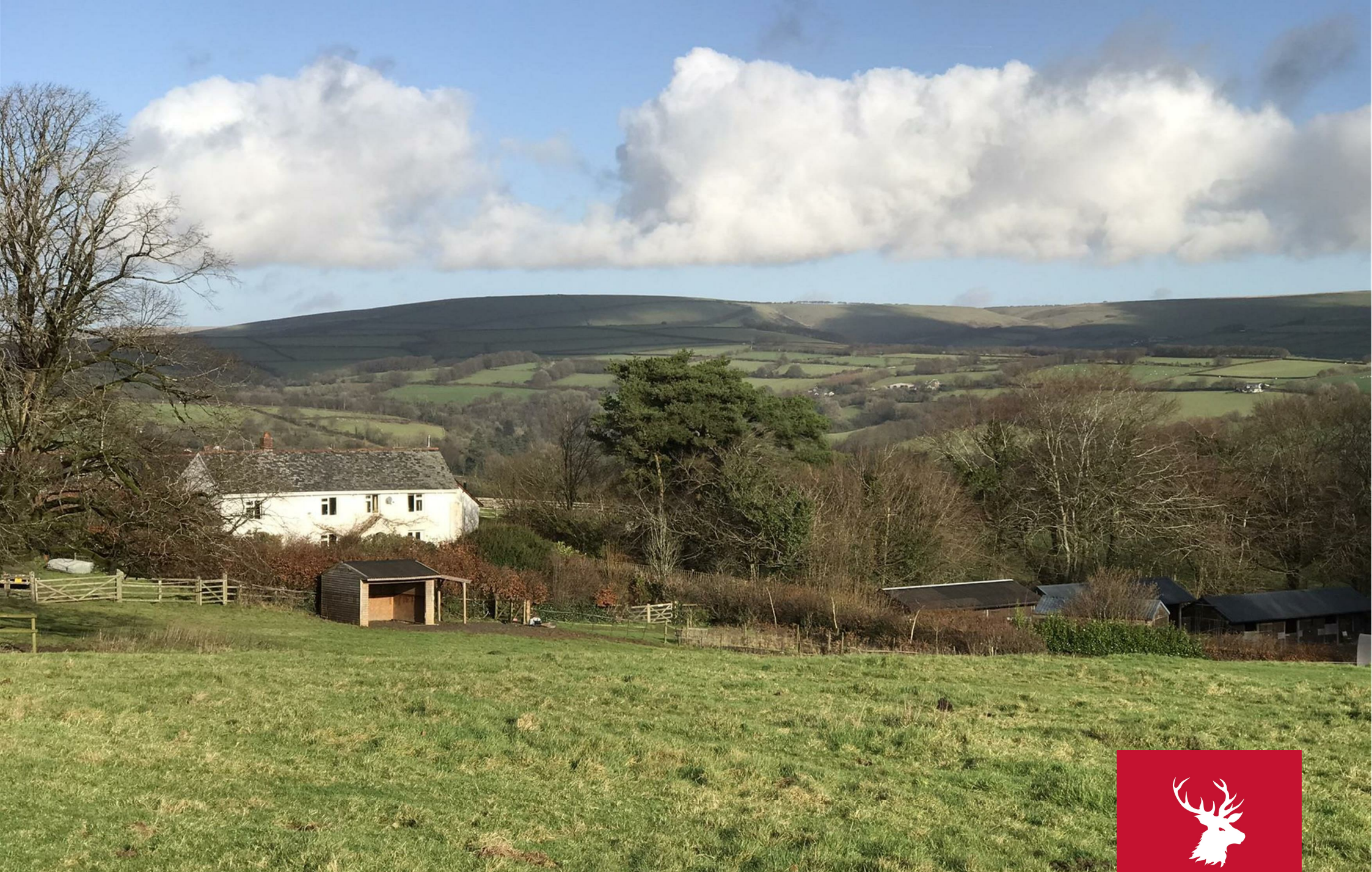
Higher Shutescombe House